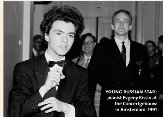
YOUNG RUSSIAN STAR: pianist Evgeny Kissin at the Concertgebouw in Amsterdam, 1991