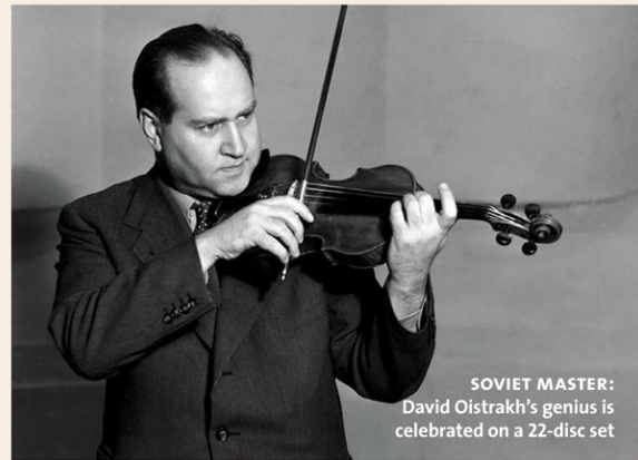
SOVIET MASTER: David Oistrakh's genius is celebrated on a 22-disc set